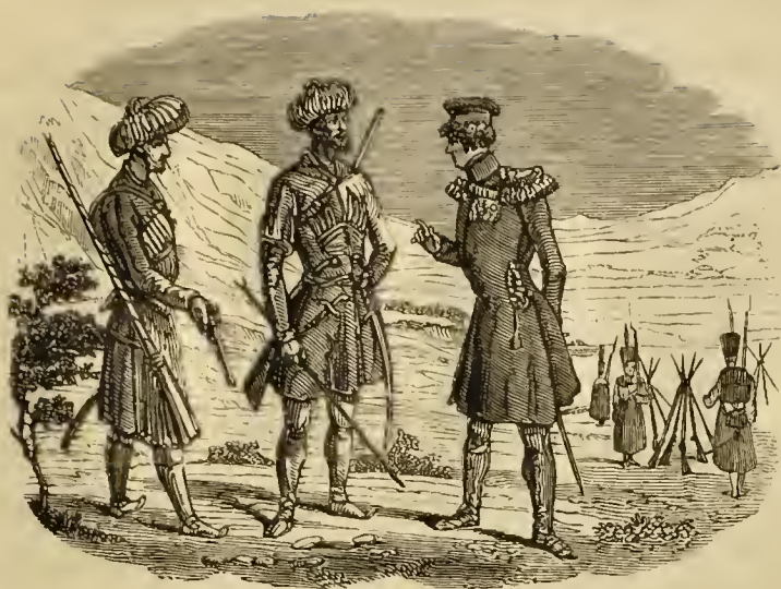
INTERVIEW BETWEEN COUNT WORRENZOW AND A CIRCASSIAN CHIEF.